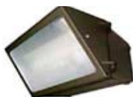
WF = Optional Flat Lens