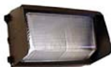
SCA = Side Cutoff Aluminum Shield